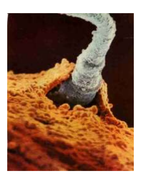
Image: Sperm – Striking, Penetrating and Cutting into the Egg during Fertilisation.